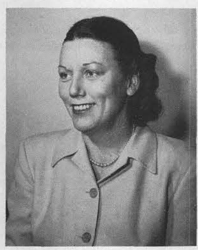
What is her job with Sandia Corporation?

Her work results in a tremendous saving in time and effort. Without the special equipment she has been trained to use, it would take hundreds of people working around the clock many years to produce results this woman turns out in a single day's work. Her job is comparatively new in the industrial field. She attended a special school to learn her work. Her job and the equipment she uses have almost revolutionized a major field of the business world. What's her line? For the answer see opposite page.